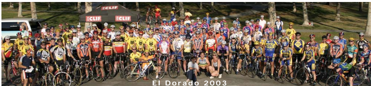
El Dorado 2003

VNCRacing@hotmail.com ♦ 714/356-1214 ♦ www.CaliforniaBicycleRacing.org